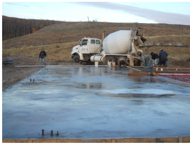
The foundation is poured on the site of the new station 2. We have been fortunate to have had nice weather for this time of year.